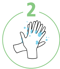
The backs of hands