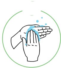
The tips of the fingers