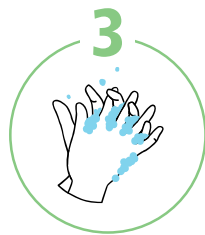
In between the fingers