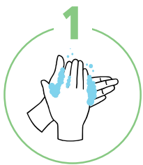
Palm to palm